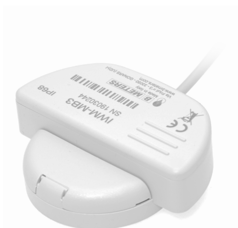
Compatible water meters